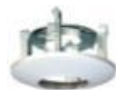
DS-1227ZJ In-ceiling Mount