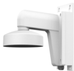
DS-1273ZJ-130B Wall Mount