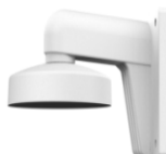
DS-1273ZJ-130 Wall Mount